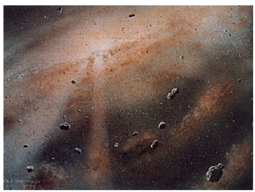
Figure 7.17 Solar Nebula. This artist's conception of the solar nebula shows the flattened cloud of gas and dust from which our planetary system formed. Icy and rocky planetesimals (precursors of the planets) can be seen in the foreground. The bright center is where the Sun is forming. (credit: William K. Hartmann, Planetary Science Institute)

One way to approach our question of origin is to look for regularities among the planets. We found, for example, that all the planets lie in nearly the same plane and revolve in the same direction around the Sun. The Sun also spins in the same direction about its own axis. Astronomers interpret this pattern as evidence that the Sun and planets formed together from a spinning cloud of gas and dust that we call the solar nebula (Figure 7.17).